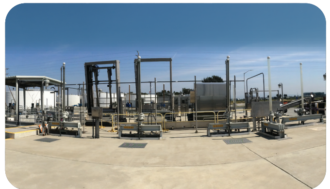
Existing headworks facilities