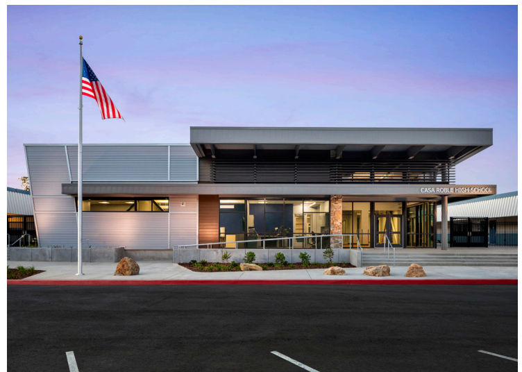
Casa Roble High School Student Union & Admin Building ▲

Also submit your project in the National Awards Competition. Remember: Western Pacific Region requirements are similar to the National Awards Program, but have significant variation in requirements. Refer to www.DBIA.org for information regarding the National Competition.