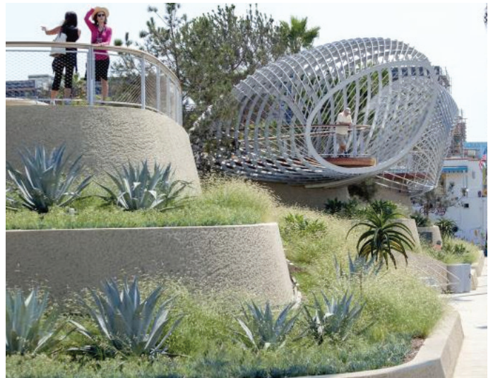
Tongva Park Genser Square ▲

Also submit your project in the National Awards Competition. Remember: Western Pacific Region requirements are similar to the National Awards Program, but have significant variation in requirements. Refer to www.DBIA.org for information regarding the National Competition.