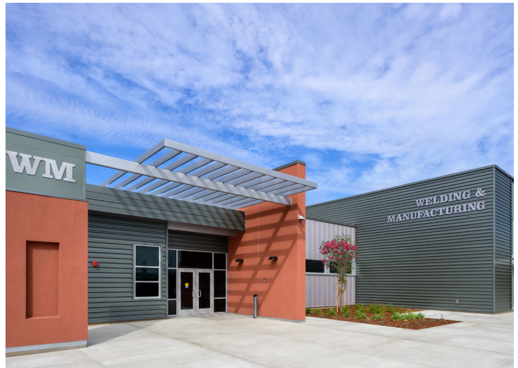
Butte College Welding & Manufacturing Building ▲

Also submit your project in the National Awards Competition. Remember: Western Pacific Region requirements are similar to the National Awards Program, but have significant variation in requirements. Refer to www.DBIA.org for information regarding the National Competition.